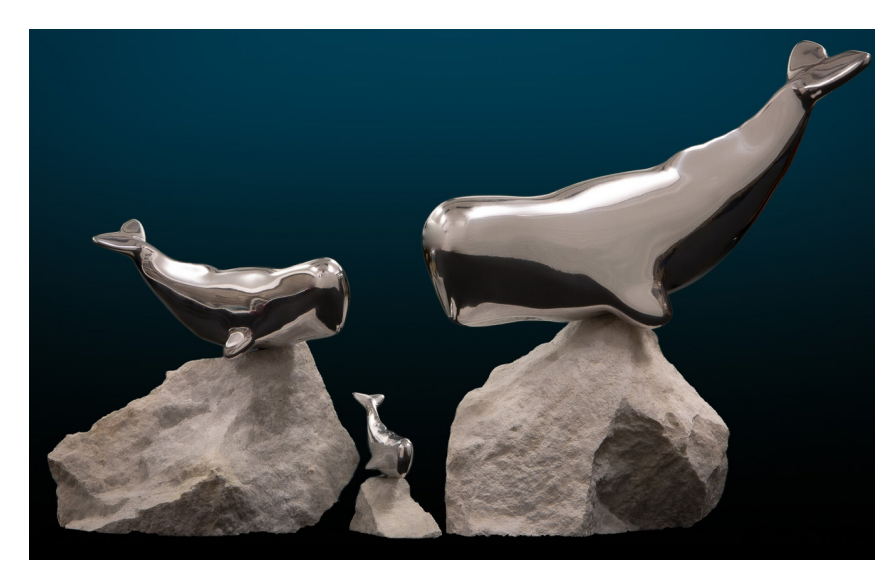
To Place an Order

To order please email info@rcistudios.com - We are currently offering pickup at RCI Studios at Research Casting International - 15 Dufferin Ave, Trenton, ON K8V 5C8, payments may be made by cash or cheque payable to Research Casting International Ltd.